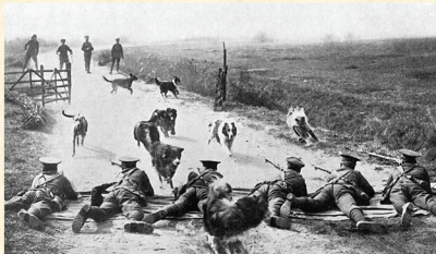
Training at the Shoebury War Dogs School.

Connecting children to their past is not always easy and just using times and dates, kings and queens can leave the younger generation uninspired. The Southend Schools Festival of Remembrance works with the stories of the Southenders who lived during the Great War and beyond to help pupils understand that the lives of everyone now and from the past is contributing to their heritage.